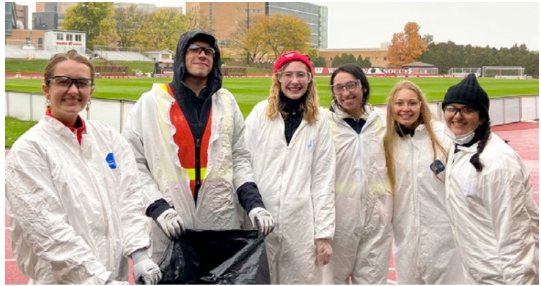
The Green Athletics intern team completes a waste audit at a soccer game during the fall 2021 semester.